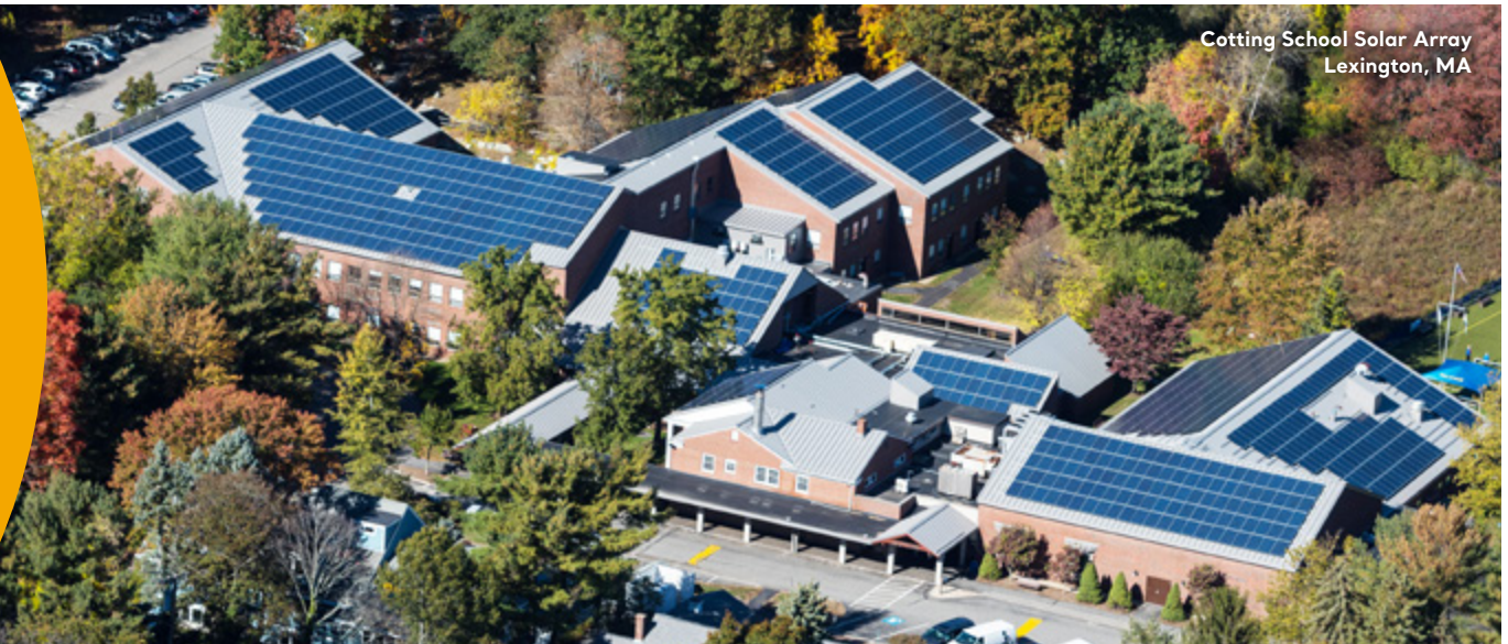
Cotting School Solar Array Lexington, MA

Enjoy a streamlined process from feasibility study to construction, operation, and maintenance — all handled by us.